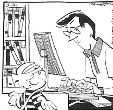
Dennis the Menace

"BUT WHAT GOOD IS A FAMILY TREE IF YOU CAN'T CLIMB IT?"