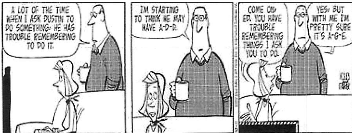
Dustin- Greenville News 10/11/2012

Don't forget to visit the Greenville Chapter's website at: http://www.greenville.scgen.org