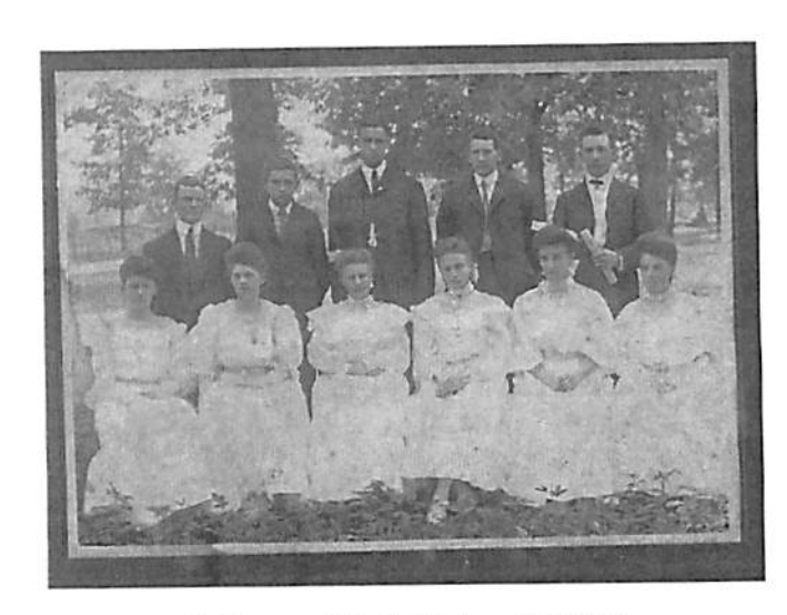
Liberty High School 1906